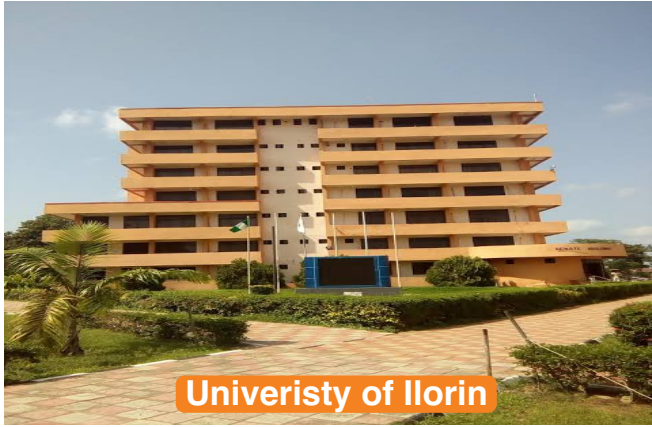
Univeristy of Ilorin