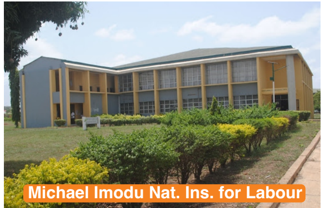
Michael Imodu Nat. Ins. for Labour