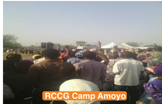
RCCG Camp Amoyo