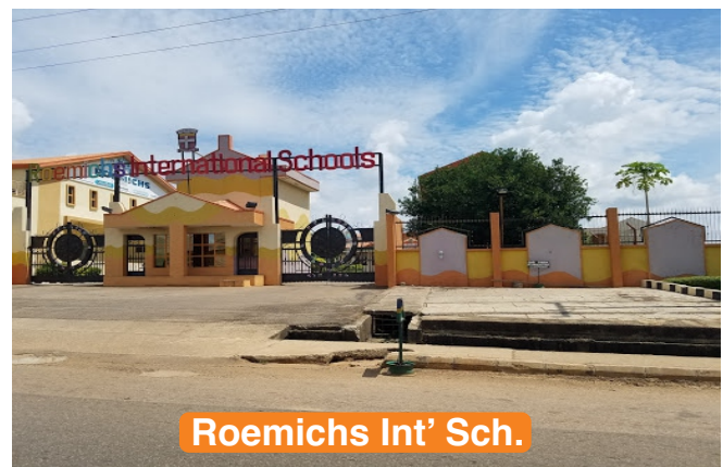
Roemichs Int' Sch.