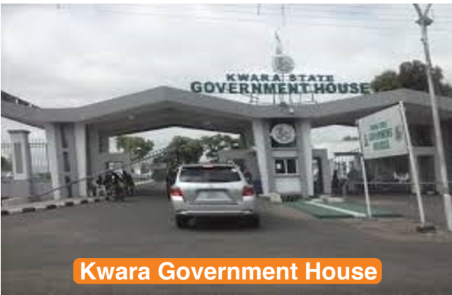
Kwara Government House