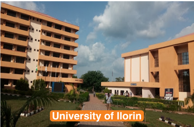
University of Ilorin